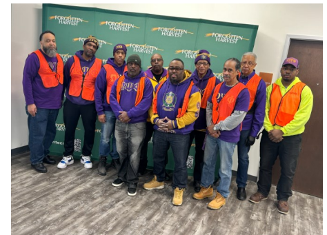
NΩ Brothers volunteering at Forgotten Harvest HQ

We must applaud and acknowledge our chapter's supportive efforts with Forgotten Harvest as a noble cause! Forgotten Harvest is a nonprofit organization based in Detroit, Michigan, dedicated to fighting hunger and food waste. They rescue surplus, prepared, and perishable food and distribute it to those in need. Our organization joining hands with Forgotten Harvest exemplifies the potential impact when different entities work together for the greater good, addressing both community welfare and environmental concerns related to food waste. It's a positive example of how collective efforts can make a significant difference in alleviating hunger and promoting a sense of unity within a community.